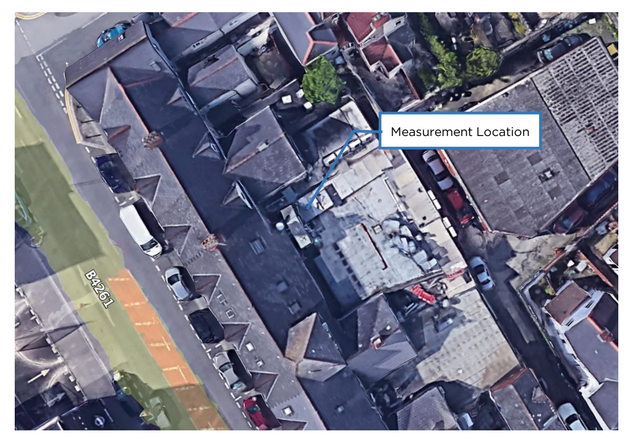
FIGURE 3: LOCATION OF MEASUREMENT LOCATION FOR MUSIC NOISE LIMITS