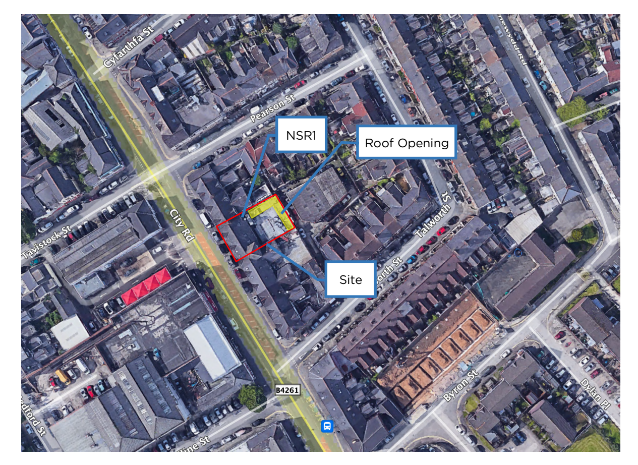
FIGURE 1: SITE AND SURROUNDING AREA

The ambient sound environment throughout the area comprises road traffic noise, arising from vehicles travelling along the nearby roads, as well as plant noise arising from the nearby commercial units.